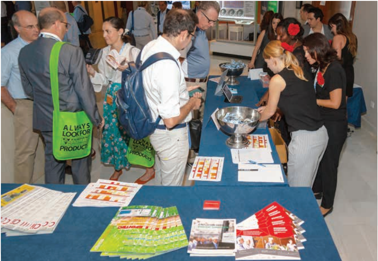
Registration desk with partner promotion materials