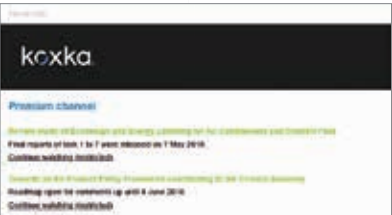
Banner in CLIMANOVELA