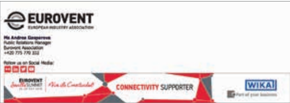
Logo in email banner