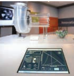
Examples of the Eurovent TechTank display