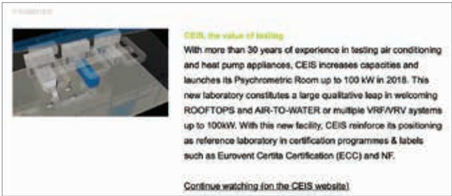
Featured article in CLIMANOVELA