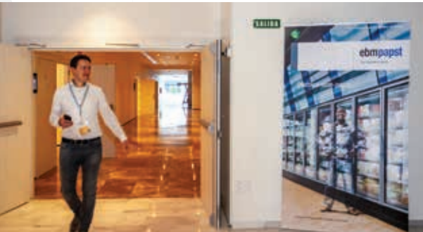
Banner placement at the entrance of a seminar room