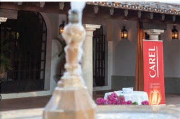
Examples of Table Sponsorship: Your organisation's rollup next to your private table