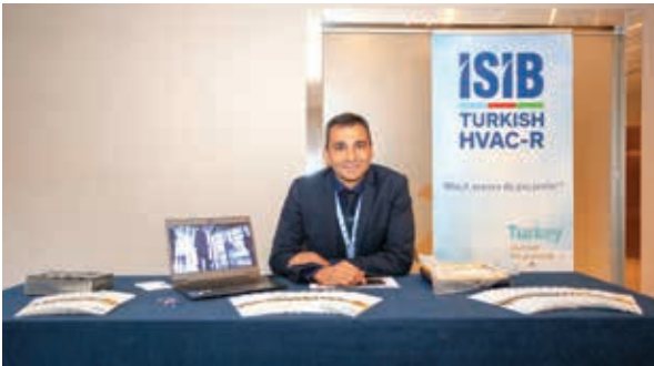
Promotion space in the conference area